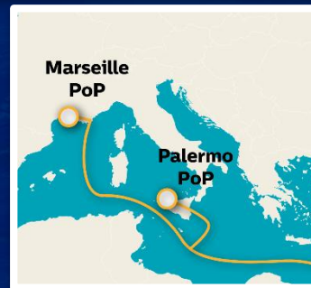
Marseille PoP and Palermo PoP